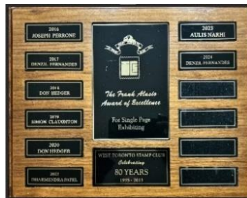
FRANK ALUSIO TROPHY