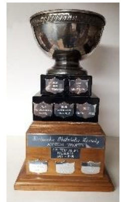
TED ALLEN TROPHY

How will you participate this year? If you have not previously done so, consider participating by building a Single Page, Multi-Page or One Frame Exhibit for this year's club exhibition.